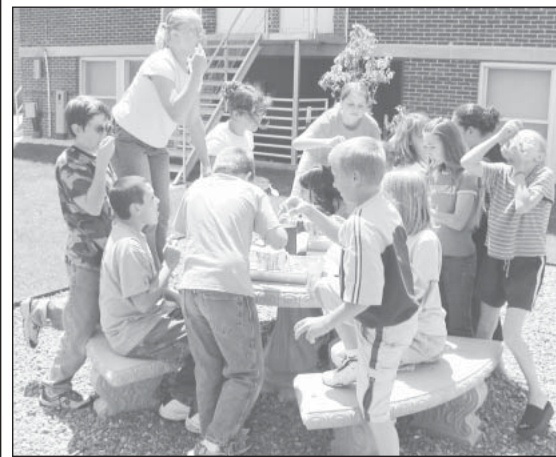
SIXTH GRADERS earned a banana split for good behavior. It was made up of three gallons of ice-cream, a huge bunch of bananas, several toppings resulting in sour stomach aches.