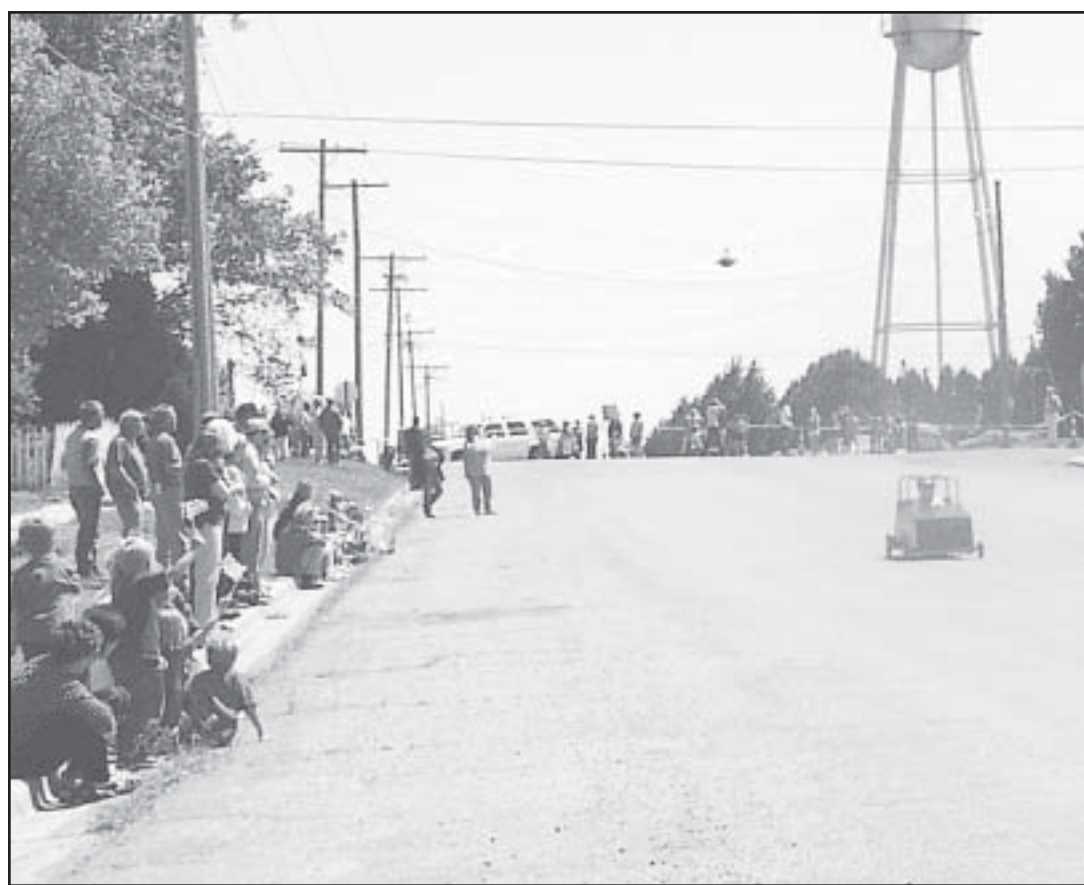
FIFTH AND SIXTH graders race down Bird Avenue in the Soap Box Derby held last week.