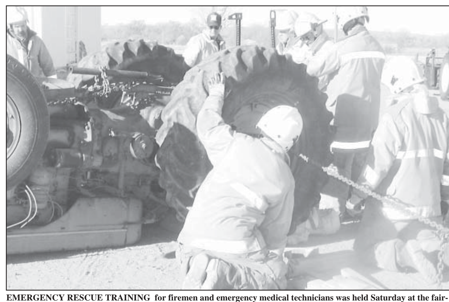
EMERGENCY RESCUE TRAINING for firemen and emergency medical technicians was held Saturday at the fairgrounds in St. Francis. Pictured is a mannequin which is trapped under an upset tractor and those taking the training are finding a way to lift the tractor without further injuring the victim.