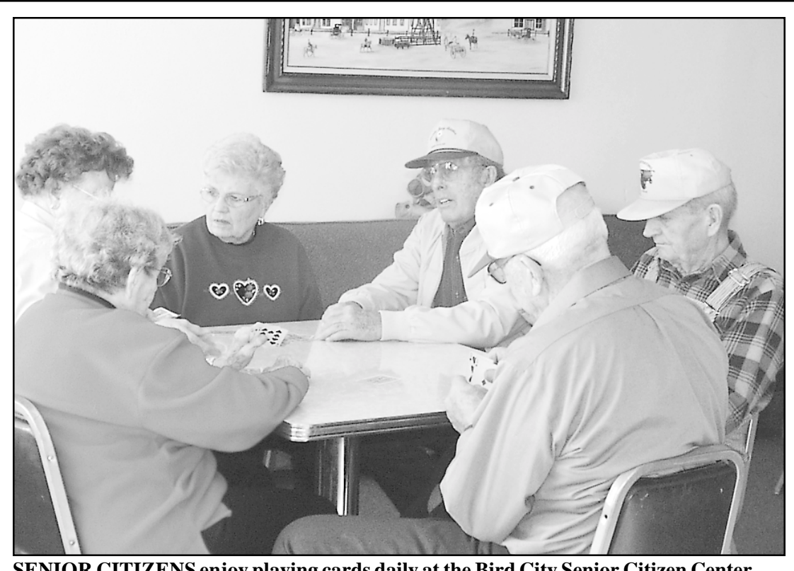
SENIOR CITIZENS enjoy playing cards daily at the Bird City Senior Citizen Center.